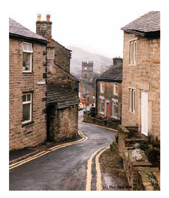
Donkey Street, Hayfield

The decline in local employment has been accompanied by a slow decline in local shops and retail outlets. At the beginning of the 20<sup>th</sup> century Hayfield boasted its own gas works, its own water supply, some 17 public houses as well as a thriving co-op and dozens of small shops supplying most local needs. At the beginning of the 21<sup>st</sup> century there are less than a dozen shops in operation and seven public houses. In contrast, house prices are some of the highest in the High Peak, with the average house in the Parish costing more than the national average at around £170,000.