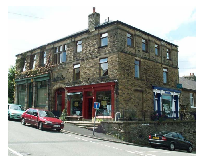
Old Co-operative Society Building

The village of Hayfield has changed out of all recognition in the past 100 years. True, the physical built environment has retained much of its earlier character, and many of the buildings from the 17<sup>th</sup> century onwards survive, as does the physical layout of the settlement. But in all other respects it is a different village. In 1901