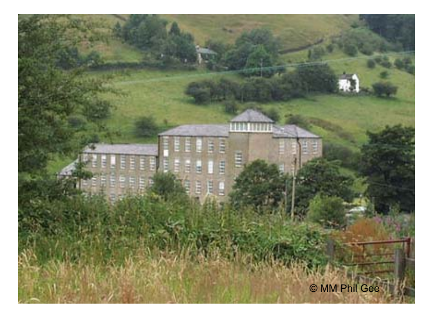
Pictured left is the old cotton mill at Little Hayfield, now a complex of luxury flats.

campsite: the Calico printworks is now an expensive housing estate; and the cotton mill, after a variety of uses, is now an upmarket housing complex.